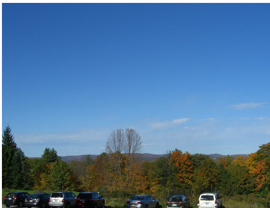
Across the Connecticut

Since this was my first mini in Hanover it was also my first stay at Pierce's, though I've been in similar places. Pierce's, so I'm told, was used by high school and prep school ski teams in New England during the colder months. (Are there still colder months?) Not too different from motels I've stayed in while single and skiing in New England, but Pierce's has a location tucked back into the woods instead of in downtown Burlington or Rutland, a long view across the Connecticut, and a friendly family running it instead of a grumpy night clerk, so all in all this was an upbeat experience. And they serve a good breakfast and dinner. If you're going to make it to one of these minis, get your reservations in fairly early so you don't have to commute.