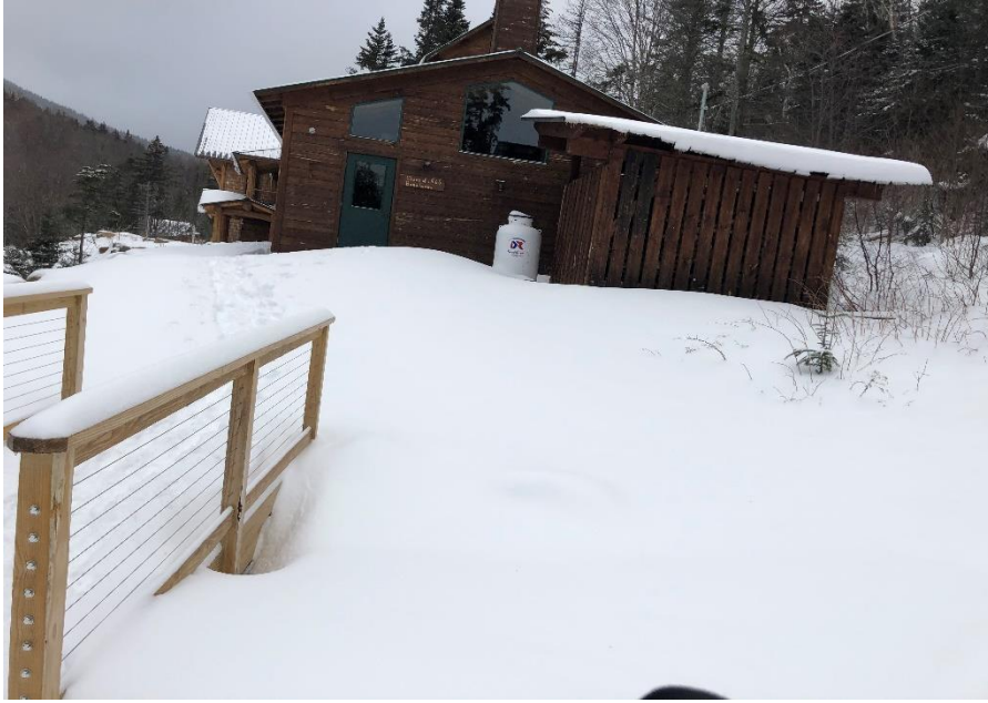
View of the back of the cabin.