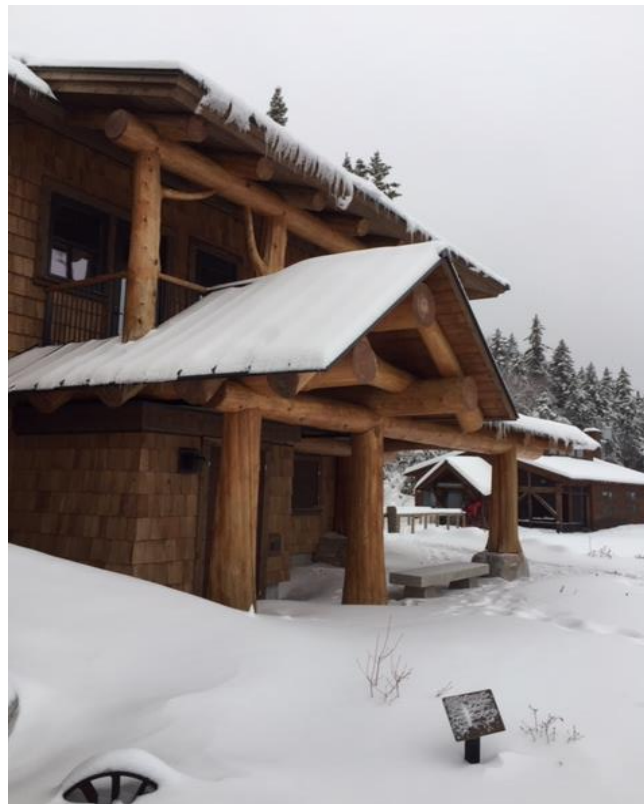
1965 cabin from the front of the Ravine Lodge