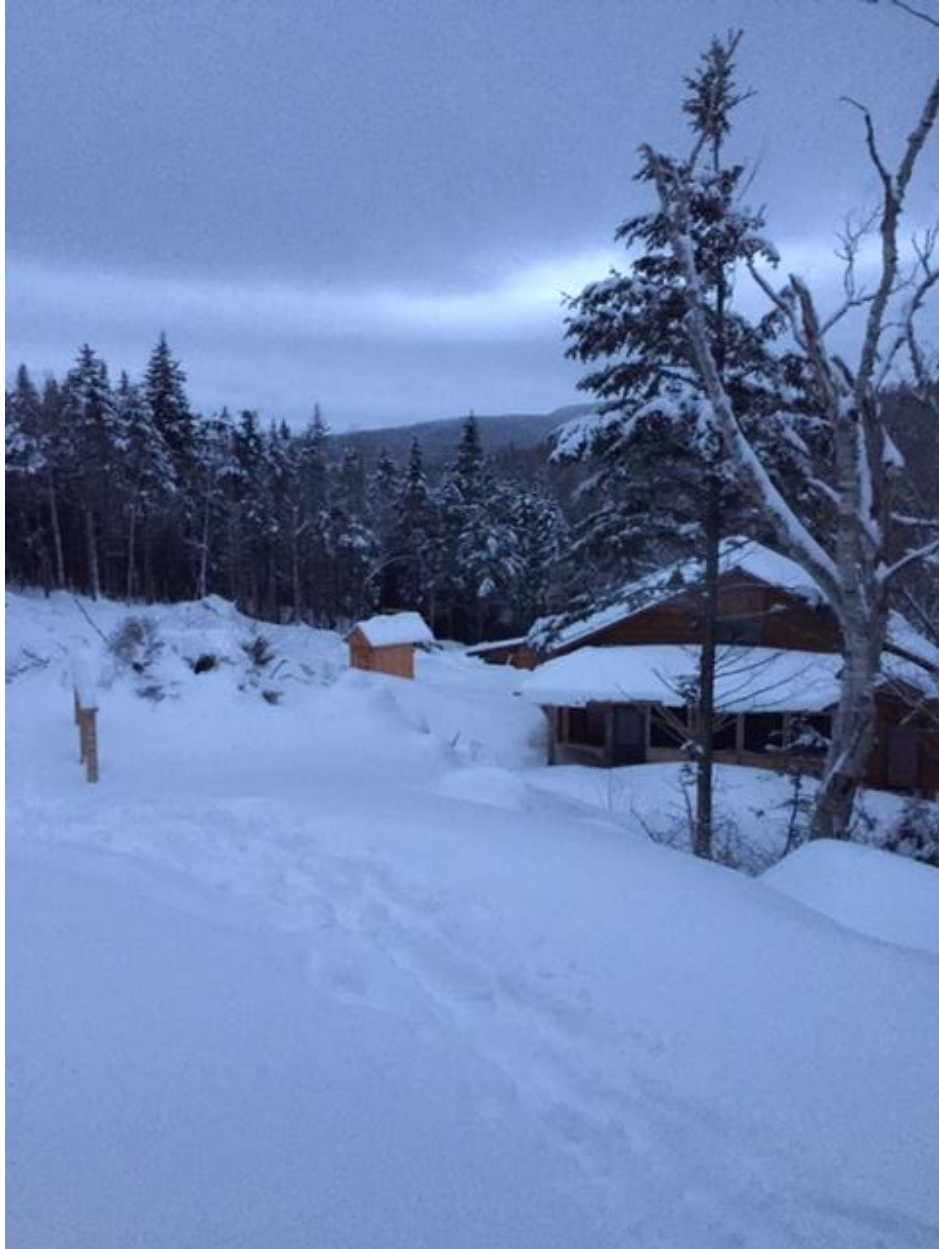
View from the back door. The building in the center is the new loo below our cabin.