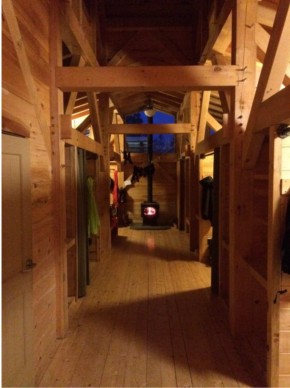
Main bunk room in the evening.