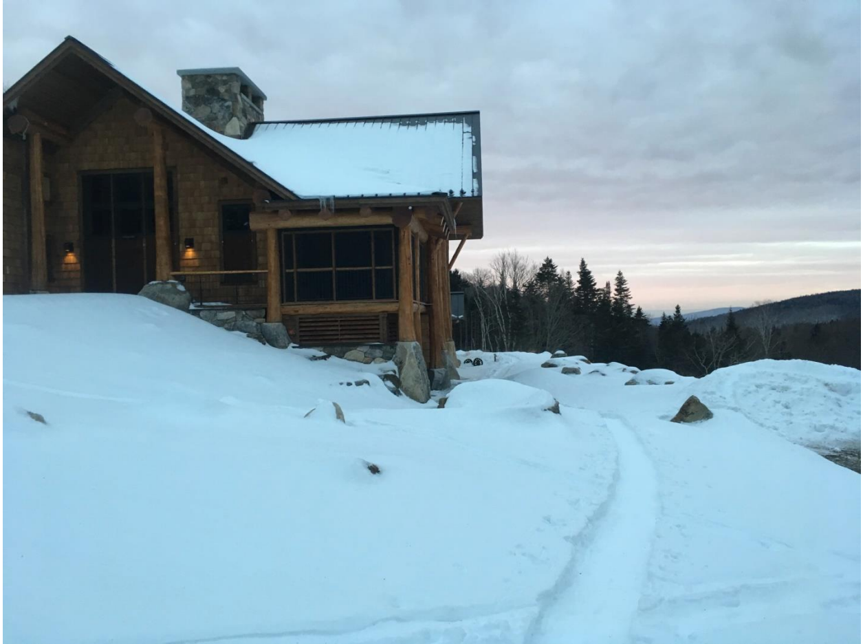
The Lodge on Monday evening.