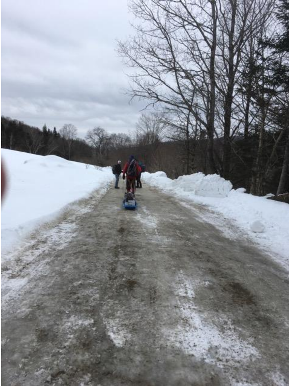
Using sleds to take supplies etc. back to the cars.